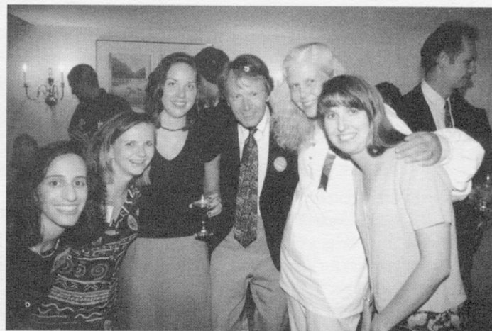
Sunday evening hospitality suite at the Boston APA Convention