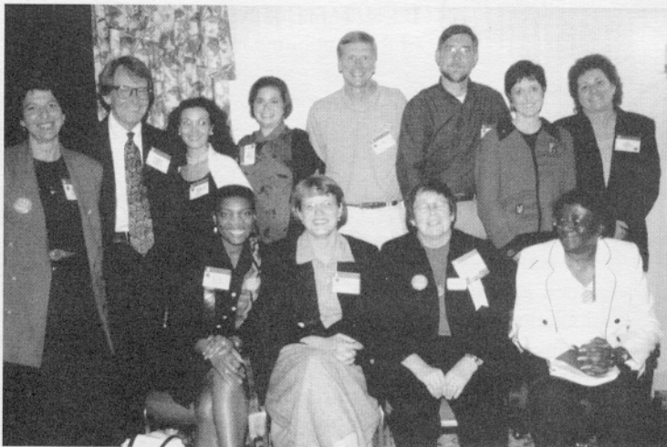
1999 Executive Board and SAG Student Leadership Co-Chairs