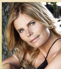
Mariel Hemingway Actress

Renaissance woman Mariel Hemingway is not only an iconic Academy Award nominated actor from a celebrated family, she is a prolific author, adventurer, eco activist, and healthy lifestyle and mental health advocate. In 2013, she was the focus of a rich and evocative documentary, which examined her personal journey to understand the Hemingway family history of suicide and mental illness. Executive produced by Oprah Winfrey, Running From Crazy won a 2013 SAMHSA Voice Award.